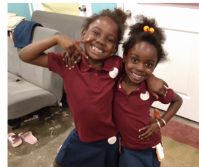
BACK TO SCHOOL READY CAMPAIGN UNIFORMS

This year marked 6 years since the inception of Just Initiative. For 5 years before the inception, God was moving in my heart and in my life, causing some radical changes to my lifestyle, my heart & my understanding of life. In January 2011, I moved to my current neighborhood and for the first time in my adult life I felt like I was exactly where I was meant to be. This was an area of town I was not familiar with, high poverty, high crime, low education rates, and beautiful relational happy people. I felt essentially like I was in a different country. I was born in Jamaica and lived in Saudi Arabia when I was young, and settled in the Tampa area when I was eight. All my adult life I felt I was living in a parallel universe from my real life. Then suddenly everything was shored up and since that time I have been at home. God has moved and showed me his love in the eyes of every person around me, expanding my heart in ways unimaginable. I am amazed and thankful every day for Just Initiative and being a part of this organization where God continues to bring together people for his glory and our good.