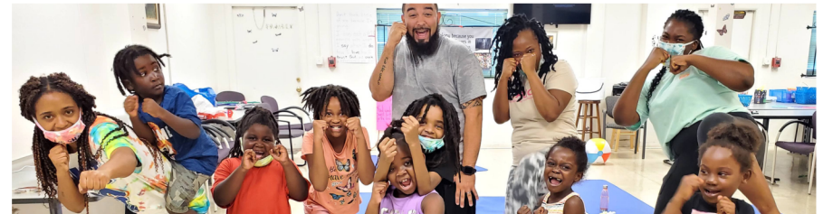
KARATE CLASS AT JUST KIDS WEEK - SUMMER 2021