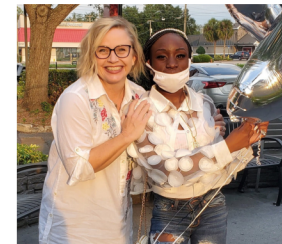
BIRTHDAY CELEBRATION APRIL 2021