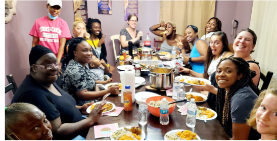
DINNER AT AN ESSENTIAL LIFE SKILLS CLASS - 2021