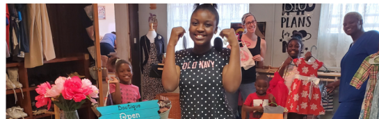
FREE BOUTIQUE OPENING - JUNE 2021