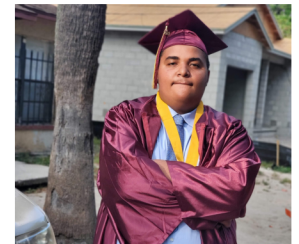
GRADUATION DAY - 2021