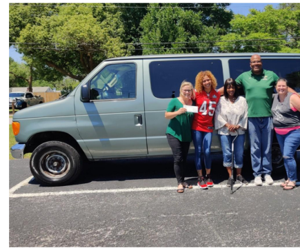
RECEIVING A DONATED VAN FROM URBAN YOUNG LIFE - APRIL 2021

We are now having weekly group tutoring, continuing mobile tutoring, and advocating for our students at their schools. We can't wait to see more children learning and educational gaps closing in 2022!