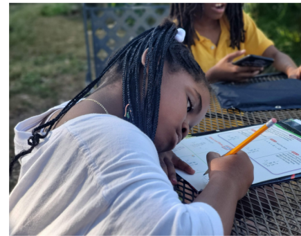
THE ZONE TUTORING IN ACTION - NOV 2021