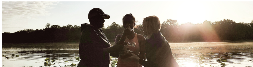
BAPTISMS IN THE RIVER AT SUNRISE - EASTER 2021